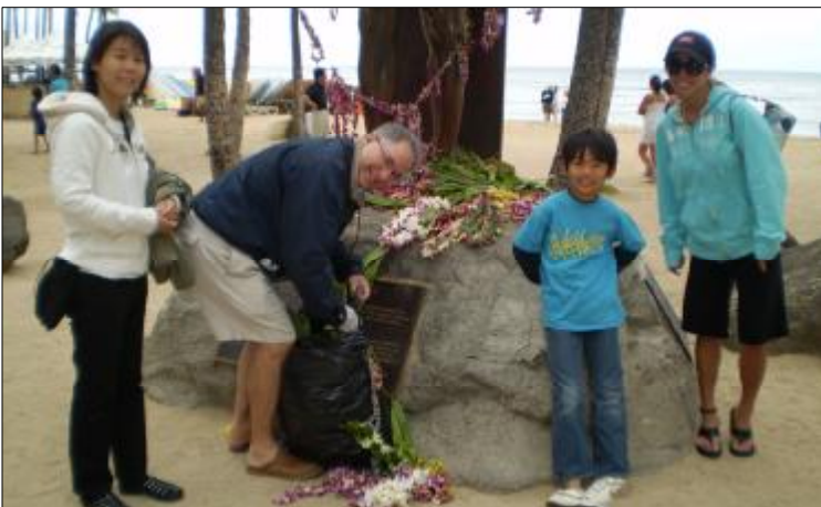
Clockwise from top right::