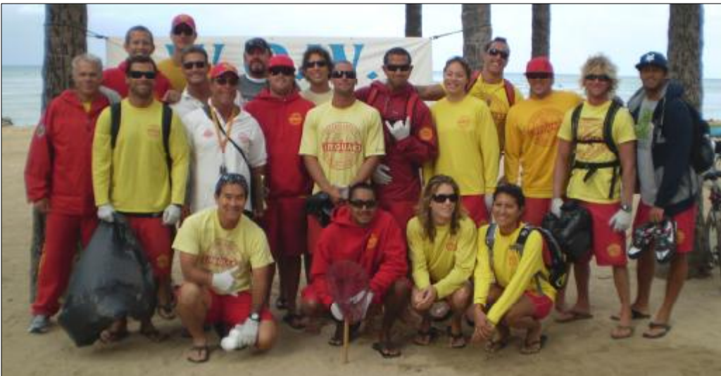
A group of Waikiki lifeguards also joined in on the beach clean-up.

Mahalo also goes out to event sponsors: ABC Stores, DFS Hawaii, E Noa Corporation, HPD-D6, Halekulani Hotel, Hawaiian Building Maintenance, Hilton Hawaiian Village Beach Resort & Spa, Hyatt Regency Waikiki Resort and Spa, International Market Place, Outrigger Enterprises, Pacific Beach Hotel, Roberts Hawaii, Sheraton Princess Ka’iulani, Royal Star Hawaii, Waikiki Beach Marriott Resort and Waikiki Trade Center.